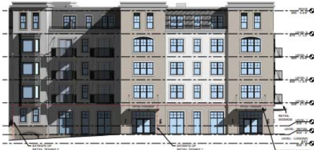
RETAIL - EAST ELEVATION 1/8" = 1'-0"