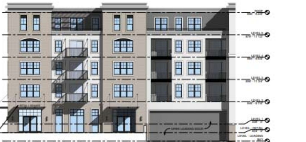
RETAIL - SOUTH ELEVATION 1/8" = 1'-0"